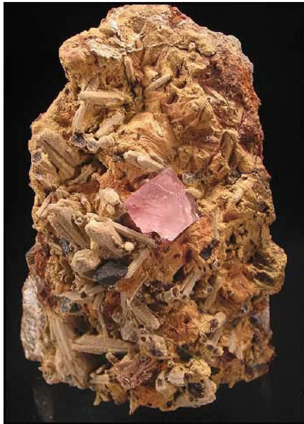
Fluorite with genthelvite crystals, 17.4 cm matrix, from the Huanggangliang mine, Chifeng, Inner Mongolia Autonomous Region, China. Khyber Minerals specimen and photo.