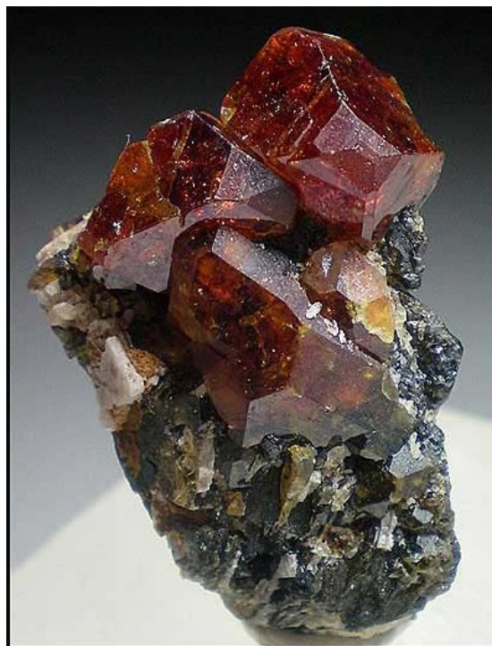
Microlite, 2.5 cm, from Macoa, Alto Ligonha, Zambezia Province, Mozambique. Trinity Minerals specimen and photo.