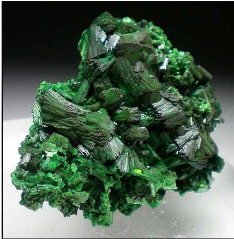
Torbernite, 5.3 cm, from the Margabal mine, Entraygues, Aveyron, France.

This small uranium mine, in a small deposit discovered during a survey by the French Atomic Energy Commission in the late 1950s, produced some world-class torbernite crystal groups in the early 1960s. By 1968, when Paul Desautels' The Mineral Kingdom was published, a picture therein of a Margabal torbernite was accompanied by Desautels' mournful remark that such specimens had become "unavailable to collectors." But at the 1990 Munich show I spotted a handful of excellent thumbnails showing sharp, blocky torbernite crystals to 1 cm aesthetically grouped on matrix; they had been dug by a couple of French collectors in 1989. I actually thought for a while that the specimen I purchased had to be one of the finest small torbernites in captivity...but soon (maybe you know the feeling) my presumptuous dream was shattered.