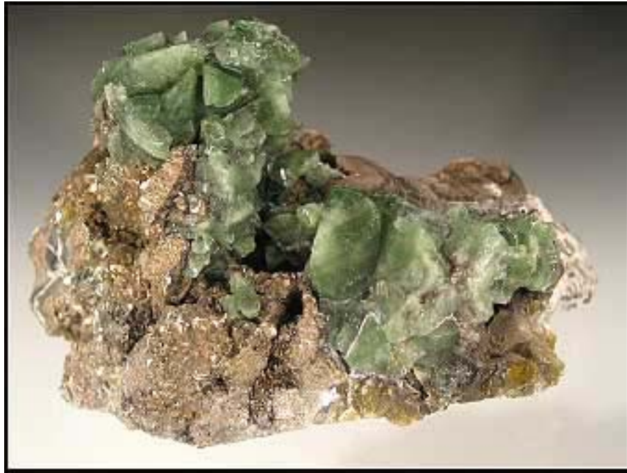
Ludlamite, 8.3 cm, from the Estaño Orcko mine, Cornelio Saavedra Province, Potosí Department, Bolivia.

matrix pieces to small-cabinet size with buttery-looking little fresnoite crystals all over. If you haven't already done so, it's time you checked out this material...another American classic.