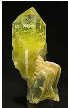
Brazilianite, 5.3 cm, from the Telirio mine, Linópolis, Minas Gerais, Brazil.

In 2007 a new German locality for galena joined the long list of classic venerables of the kind, when the Mayer limestone quarry, 15 km east of the old Carolingian capital city of Aachen, in Nordrhein-Westfalen, produced about 2,500 galena crystal groups from a big, pockety sulfide zone on the quarry's floor. The specimens all look much alike, but it is a good way to look: they are tight clusters of metallic gray and highly lustrous, octahedral to cuboctahedral galena crystals to 3 cm individually. The specimens have no matrix or visible associated species, and they reach mid-cabinet size. Mayer quarry galena has gotten scarce during the past few years, but now Jordi Fabre ( www.fabreminerals.com ) has 10 excellent examples, large-miniature to small-cabinet size, on his site. And for an aesthetic change of pace, see also Jordi's five fine miniatures of that favorite of young and old, brazilianite , in bright yellow, gemmy, lustrous, wedge-terminated blades to 4 cm, with crystals of muscovite and orthoclase. Jordi gives the locality for these pretty pieces only as Linópolis, Divino de Larenjeiras, Minas Gerais—but experience suggests that their specific source can only be the Marcel Telirio mine.