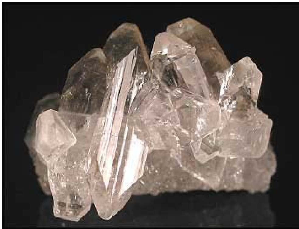
Apophyllite, 2.6 cm, from the Huanggangliang mine, Chifeng, Inner Mongolia Autonomous Region, China.