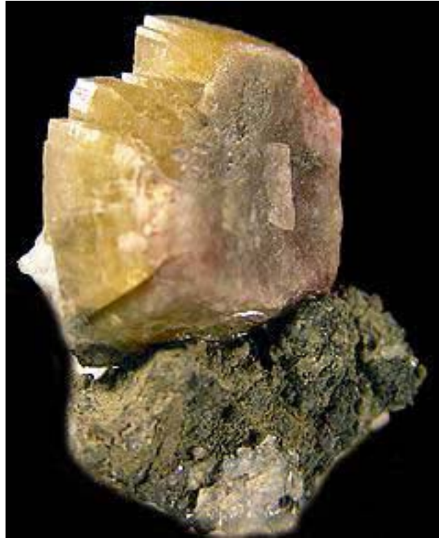
Fresnoite, 2 cm, from the Junnila property, Clear Creek district, San Benito County, California.