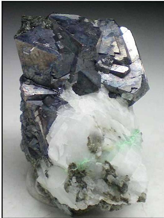
Gersdorffite, 4.1 cm, from the Ait Ahmane mine, Bou Azzer, Morocco. Trinity Minerals specimen and photo.