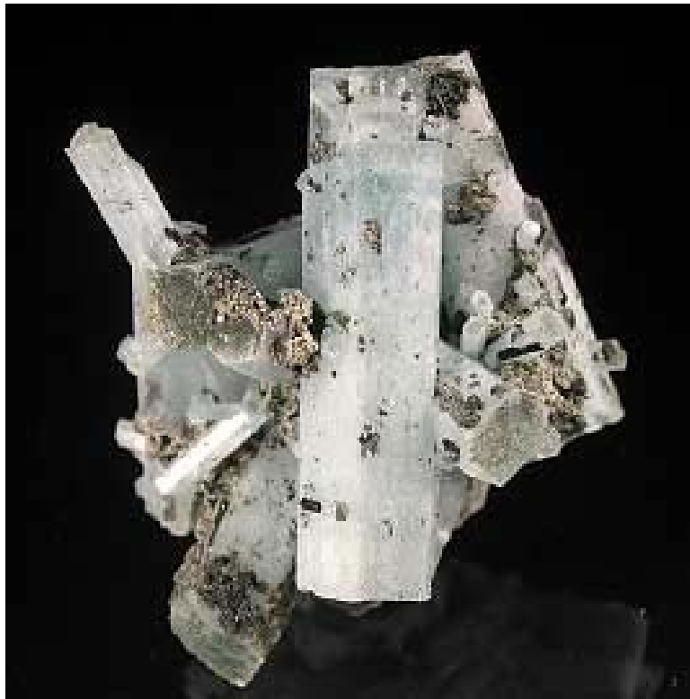
Aquamarine beryl, 5.8 cm, from the Huanggangliang mine, Chifeng, Inner Mongolia Autonomous Region, China.