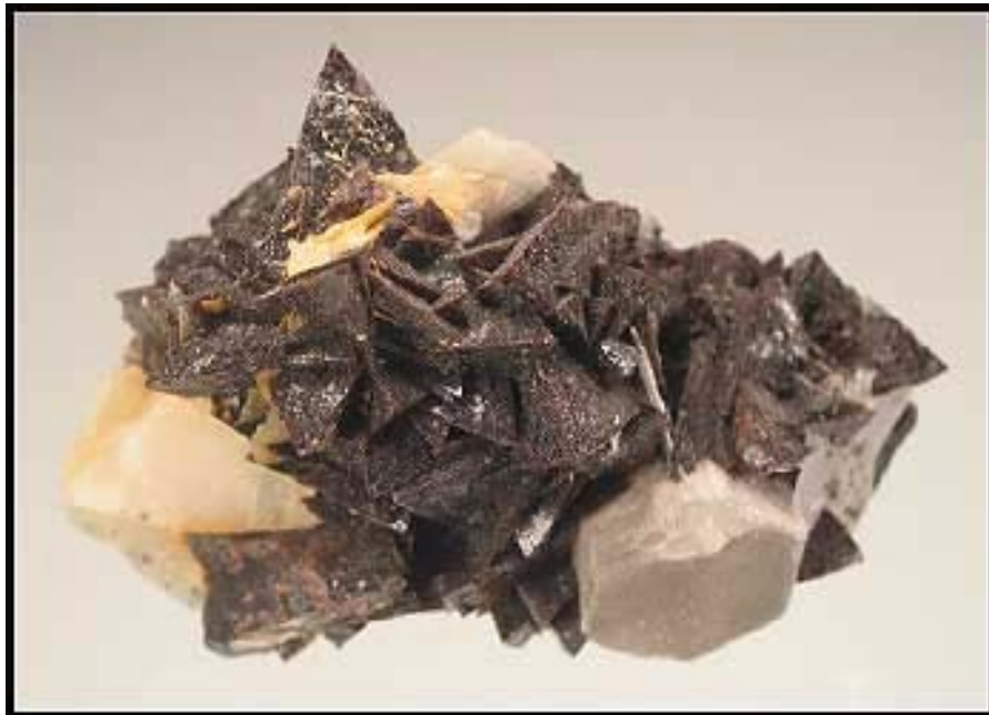
Genthelvite, 6.2 cm, from the Huanggangliang mine, Chifeng, Inner Mongolia Autonomous Region, China. Khyber Minerals specimen and photo.