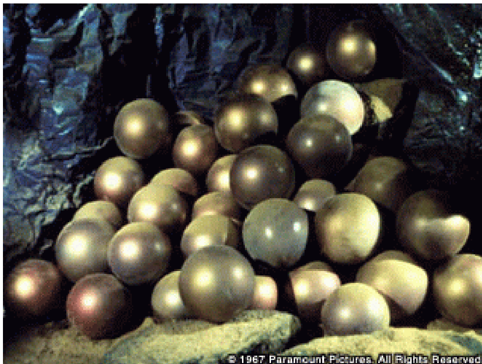
Figure 5. Biogenic silicon (eggs of the horta).

subsequently developed by a German ceramic lab—Institut für Keramische Technologien und Sinterwerkstoffen (Fraunhofer)—in 2002. It consists of sintered alumina creating a synthetic corundum and is named “transparent alumina.” Episode: Star Trek IV: the Voyage Home (MPF), 1986