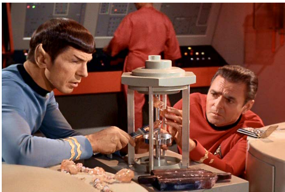
Figure 3. Leonard Nimoy (Mr. Spock) and James Doohan (Montgomery Scott) installing dilithium crystals in the Enterprise power converter.