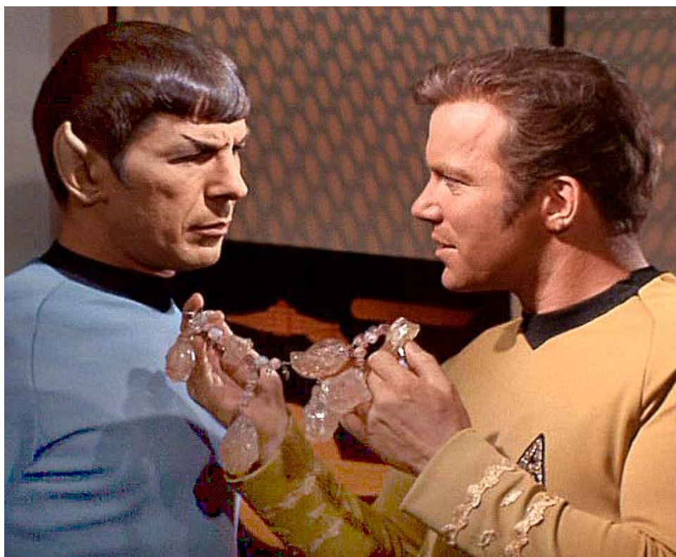
Figure 2. Leonard Nimoy (Mr. Spock) and William Shatner (Capt. Kirk) discussing the necklace of dilithium crystals.