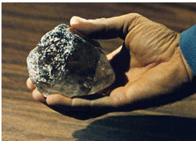
Figure 4. Captain Kirk holds a sample of “dilithium” ore (actually a smoky quartz crystal used as a prop).

A metallic substance of high density used by the Kelvin. Episode: By Any Other Name (TOS), 1968