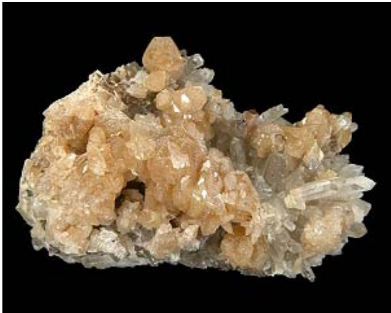
Monazite-(Ce), 3.3 cm, from the Siglo XX mine, Llallagua, Bustillo Province, Potosí Department, Bolivia. Mineral Classics specimen and photo.

The massive update also offers fine specimens of stibnite from the La Salvadora mine, Oruro Department (found in the early 1980s); boracite crystals to 1 cm, some pale green and others peach-colored, in gray matrix from Alto Chapare, Cochabamba; copper in great, loose fans, resembling ginkgo leaves, to 10 cm, from Corocoro (found early in 2011—see also the 2011 Tucson Show report); phosphophyllite and hopeite from the new occurrence in the Huayllani mine, Machacamarca; magnetite from Cerro Huañaquino, Potosí (brilliant black octahedrons scattered on matrix plates to 12 cm); siderite , some specimens showing gemmy yellow-brown crystals to 2 cm, from several localities; and, among the Bolivian oddities, scorzalite , arsenopyrite , metastibnite , sphalerite and pyromorphite . Whew.