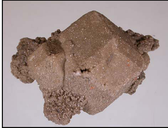
Ankerite epimorph after sodalite, 3.7 cm, from Mont St.-Hilaire, Quebec.