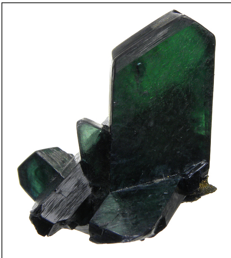
Vivianite, 3.4 cm, from the Morococala mine, Santa Fe district, Dalence Province, Oruro Department, Bolivia. Mineral Classics specimen and photo.