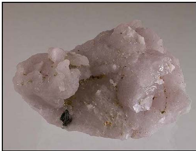
Suolunite, 6.8 cm, from the Lac D’Amiante mine, Thetford Mines, Quebec.