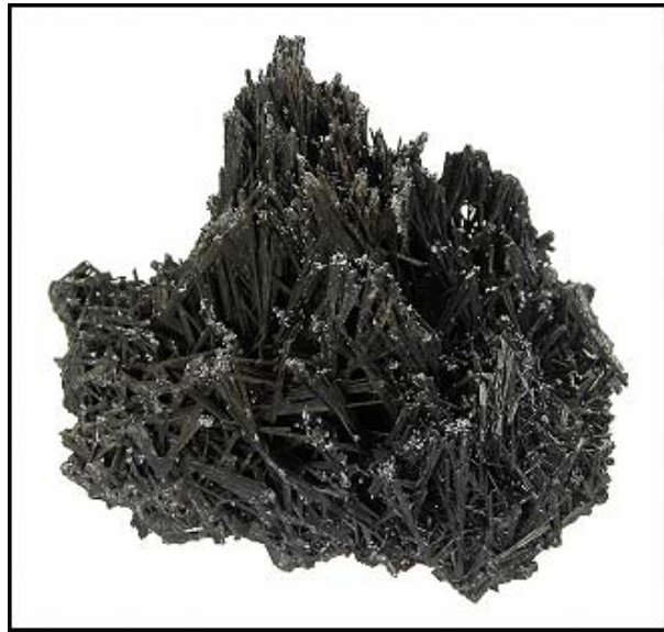
Zinkenite, 5.8 cm, from the San José mine, Oruro city, Cercado Province, Oruro Department, Bolivia.