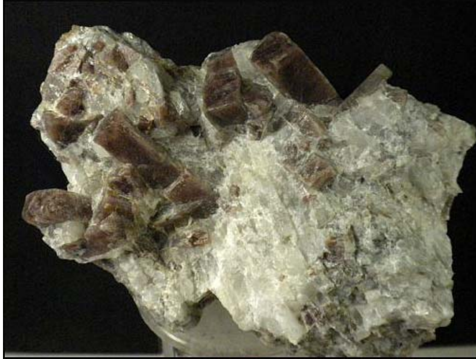
Andalusite in quartz, 10 cm, from the Bregaglia Valley near Chiavenna, Lombardy, Italy.