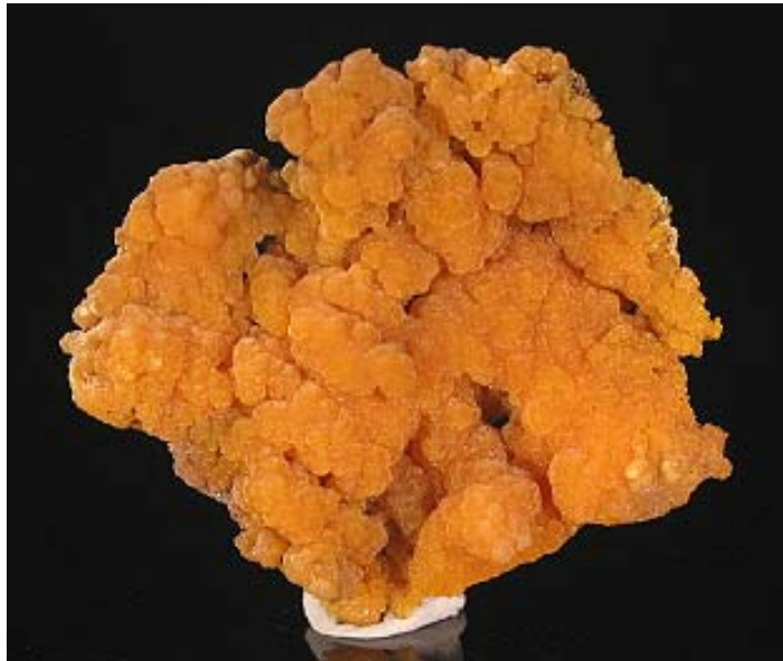
Mimetite, 4.8 cm, from the Nakhlak mine, Anarak district, Isfahan Province, Iran.